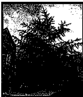
Our now departed Ginkgo Biloba during the Summer