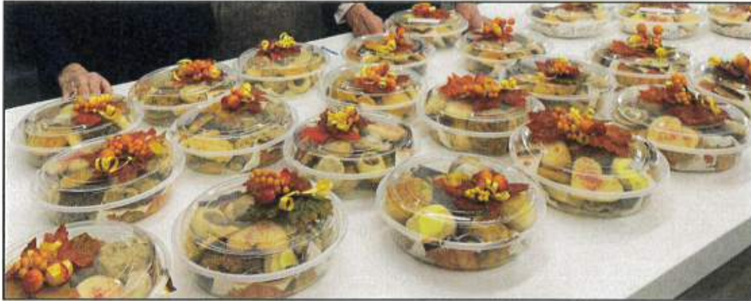
October 2023 Thanksgiving themed cookie containers delivered by PCMT